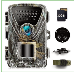
(generic image of a trail camera)

Allotments often have no mains power, so CCTV is mainly limited to: Trail cameras or something like the U-Watch cube.