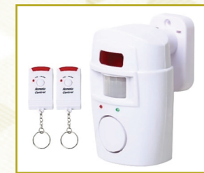
Shed alarm If you do not have a house alarm or cannot extend it to where the shed is situated, then the battery-operated unit is a good option. Once set using the remote, the units PIR sensor detects movement and when activated has a flashing red light and emits a loud siren.