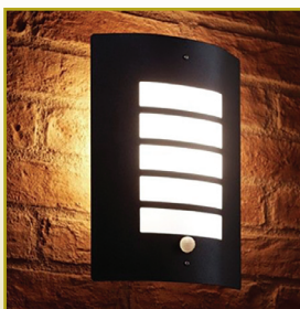
Hard wired dusk to dawn light Appx £25

Thieves do not want to be seen as there is more chance of being caught if they are. Good quality lighting either dusk to dawn or security type are good ways of lighting the area around the shed / garage.