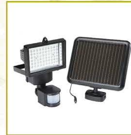
Solar security light Appx £30