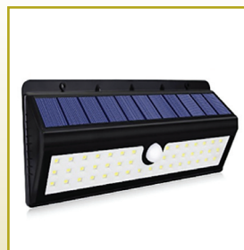
Solar powered dusk to dawn light (for where there is no power option) Appx £20