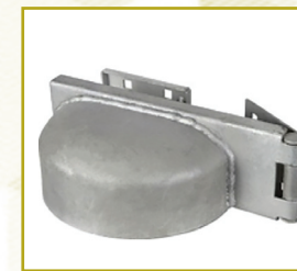
Padlock protector reduces the risk of the padlock being cut off. Appx £20-25