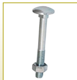
Coach bolts these should be used to fix the door furniture to the shed to prevent a suspect simply unscrewing the lock and hasp from the wooden door Appx £2 for a pack of ten