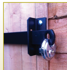
Locking bar Help prevent the door from being forced open Appx £30