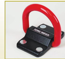
A good quality ground anchor secured to the floor of the shed when used with a good quality lock and chain, will help prevent items of value being stolen. Appx £50 (for the ground anchor)

Once the physical exterior of the shed has been secured, it is just as important to secure the property within it.