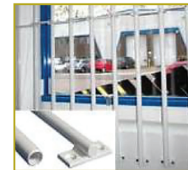
Security Bars Shed windows are generally a single pane of glass or plastic and are easy to force. A metal grill fitted on the inside of the shed will help prevent the window being used as a point of entry. Appx £30 per window

Property of value should not be easily visible from outside of the shed. Consider fitting some net curtains to reduce the visibility from outside.