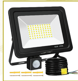
Hard wired LED security light (try to avoid the old halogen types that use more power and the bulbs do not last very long) Appx £30