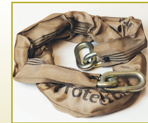
Good quality chain to be used in conjunction with the ground anchor. Appx £50-60